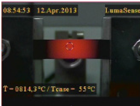
Example video image

InfraWin is easy-to-use measurement and evaluation software for remote configuration of stationary, digital IMPAC brand pyrometers.