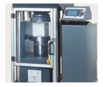
MATERIAL TEST MACHINES