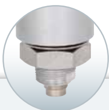
■ Pendulum version